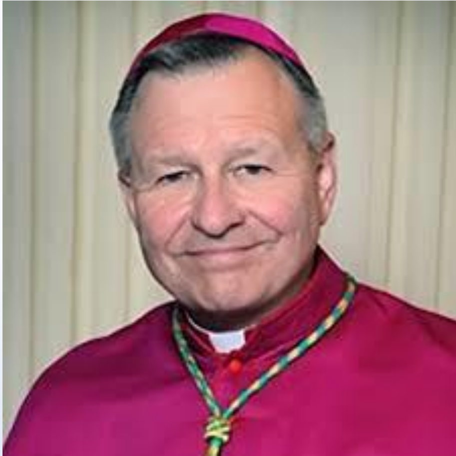
Archbishop Gregory Aymond Archdiocese of New Orleans, LA.